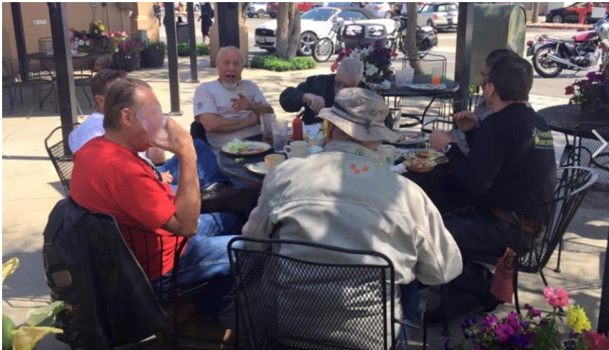
Lunch Saturday at Chiriaco Summit café.