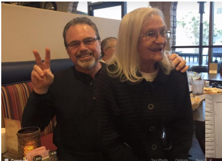
Saturday night banquet was an excellent wrap-up to a great weekend!